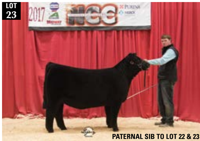
PATERNAL SIB TO LOT 22 & 23